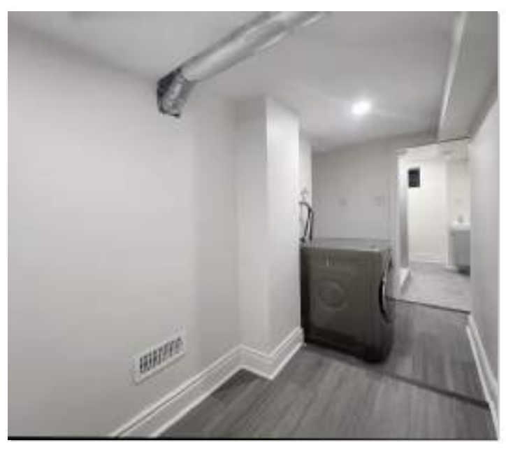
62 Ashburnham Rd (Lower) Corso Italia- Davenport