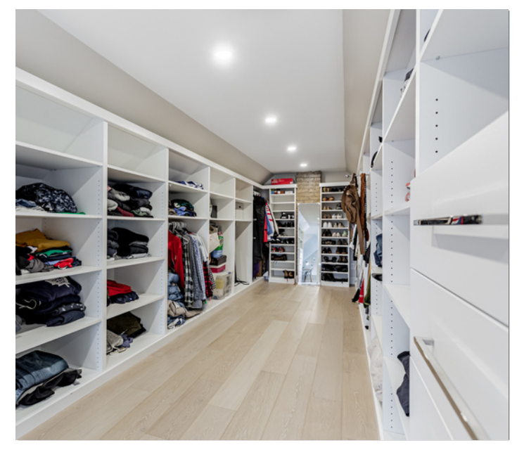
261 Lauder Avenue Oakwood-Vaughan