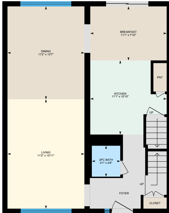
Main Floor Exterior Area 762.80 sq ft

Main Building: Total Exterior Area Above Grade 1551.66 sq ft