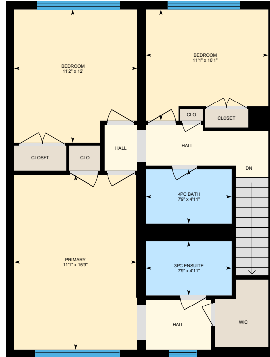
2nd Floor Exterior Area 788.87 sq ft