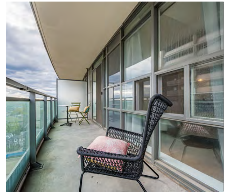
736 Spadina Avenue #1201 University