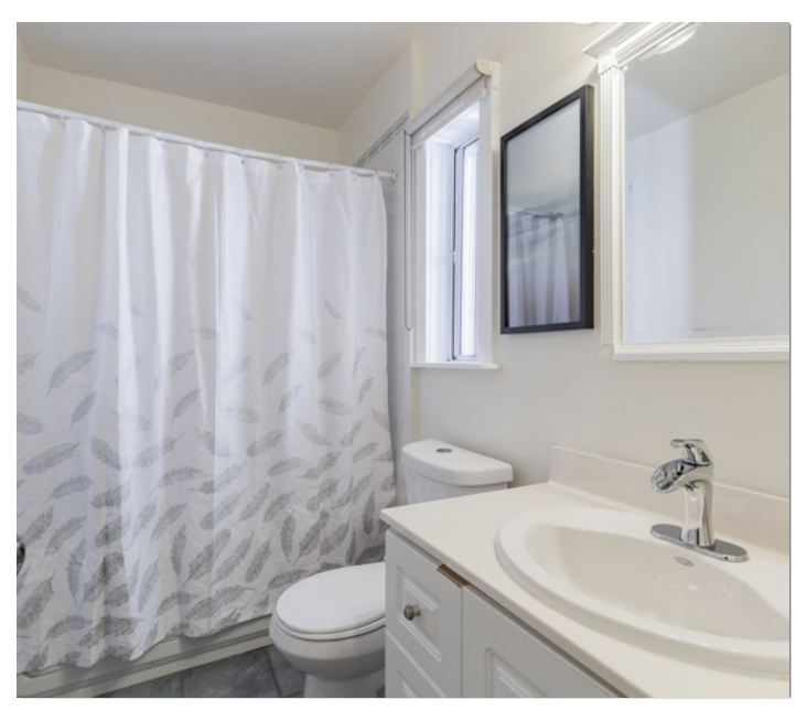
96 Ilford Road Wychwood