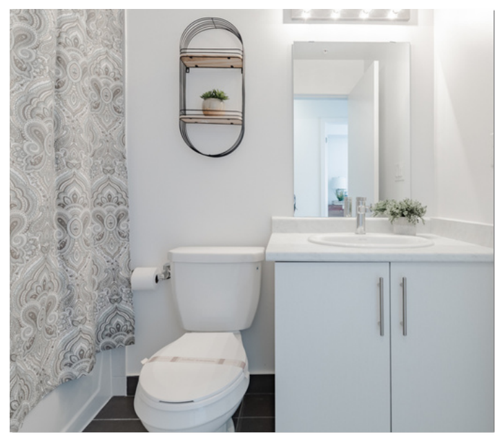
3476 Widdincombe Way #21 Erin Mills

Property Type Townhouse Parking 1 Underground